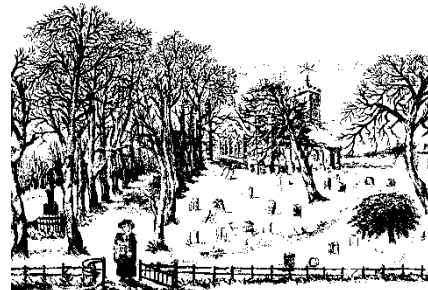
Oil painting of the church c. 1820